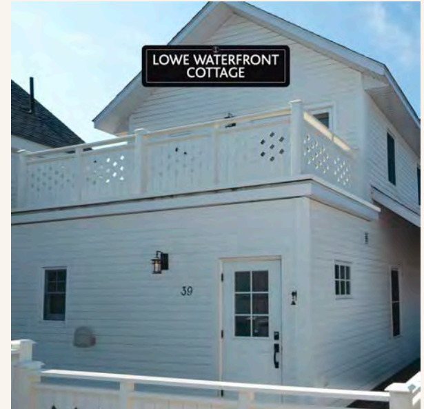
The Lowe Waterfront Cottage – A two-bedroom retreat with full kitchen, spacious living and dining areas and a private balcony off the master suite.