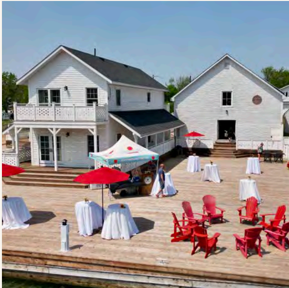
The Ice House Event Space – Perfect for 20 - 60 guests, with options for indoor or outdoor dockside ceremonies.

Your wedding at the Ice House includes exclusive use of: