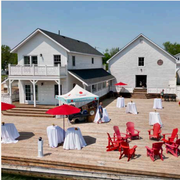
The Ice House Event Space – Perfect for 20–50 guests, with options for indoor or outdoor dockside ceremonies.

Your wedding at the Ice House includes exclusive use of: