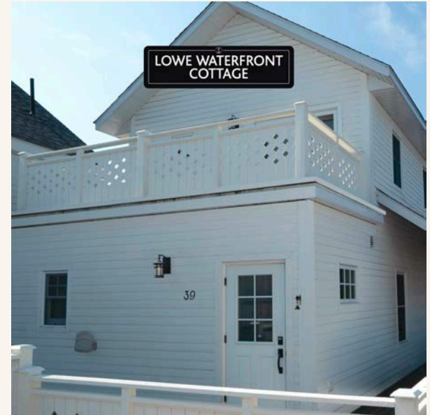
The Lowe Waterfront Cottage – A two-bedroom retreat with full kitchen, spacious living and dining areas and a private balcony off the master suite.